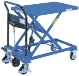
Manual • Standard