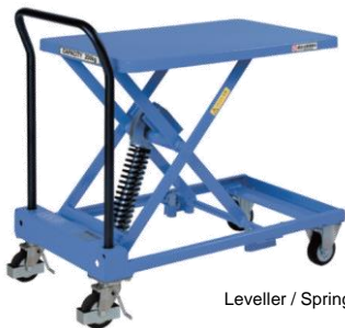
Leveller / Spring Type