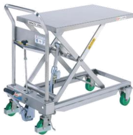
Manual • Stainless Steel