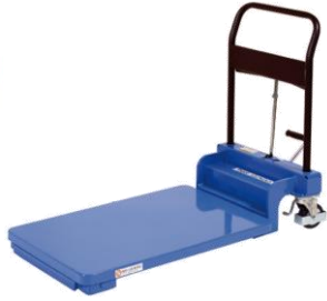
Manual • Low Profile